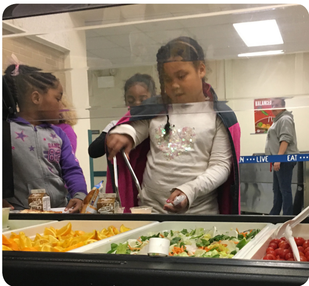
Pictured above: Children at Muskegon Public Schools. The lettuce and broccoli in the salad bar that day were Michigan-grown.